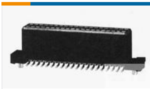
TE Part # 104550-5 40 SYS50 SURFMNT DRST RCPT