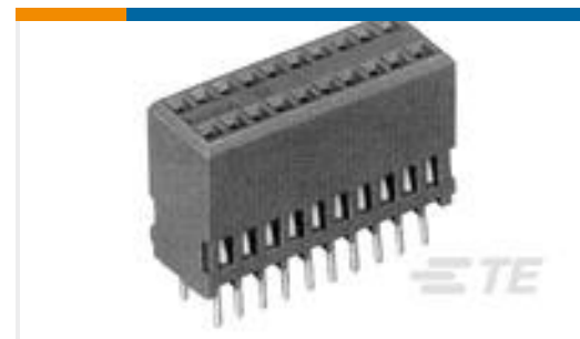
TE Part # 104744-6 40 SYSTEM 50 RCPT ASSY DRST