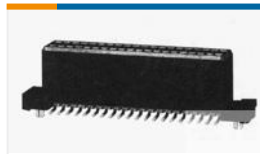
TE Part # 147378-4 40 SYS50 SMT RCP DR SHD W/O HD